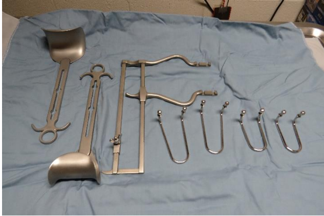
Medium Balfour retractor with everything in picture, $50