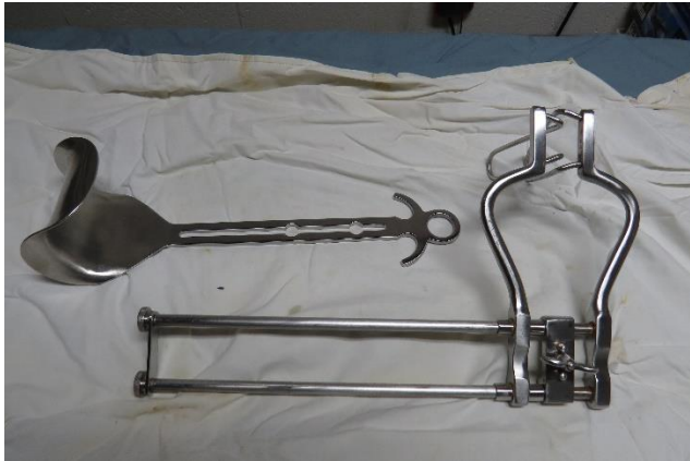
Large Balfour retractors $50