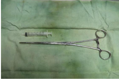
Doyen forceps $10