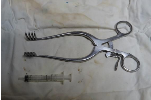
Sharp weitlaner $25