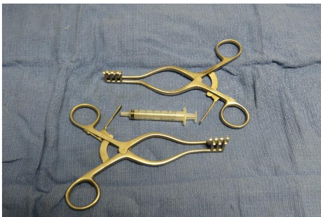
Baby weitlaner retractors, 2 pair (4 total) $25 each