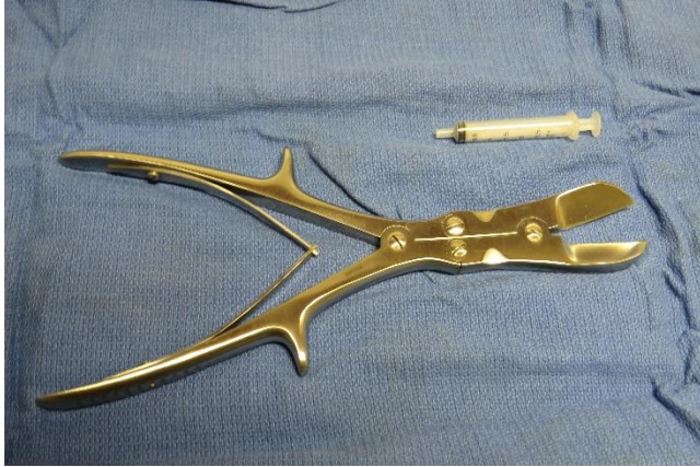
Bone cutting instrument, double action, stainless steel, excellent, 3 cc syringe for size