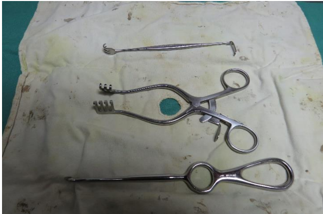
Assorted retractors including blunt weitlaner