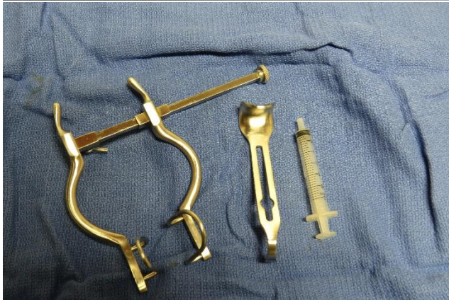
Baby Balfour (not gold – it's the lighting) good size for puppies and cats $50