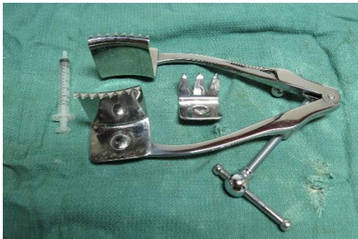
Laminectomy retractors -