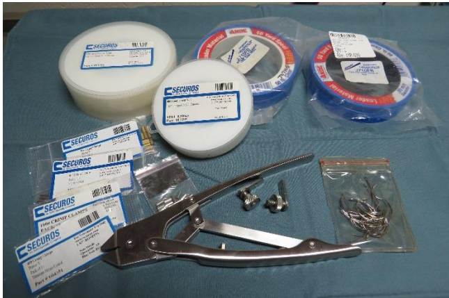
Securos cruciate crimping system with needles, suture, clamps. Used, but like new condition. $500 for set-up