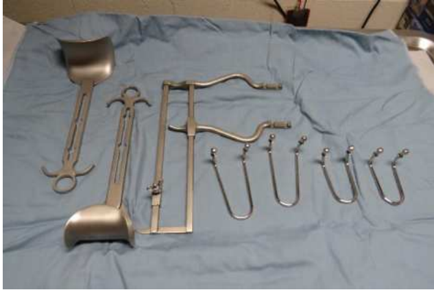
Medium Balfour retractor with everything in picture