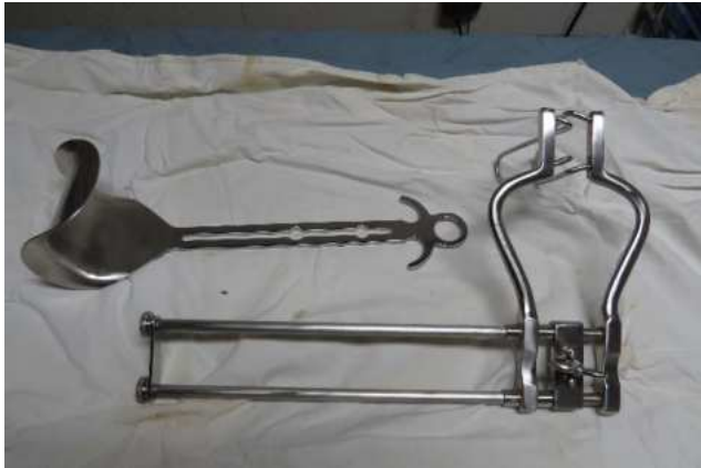
Large Balfour retractors