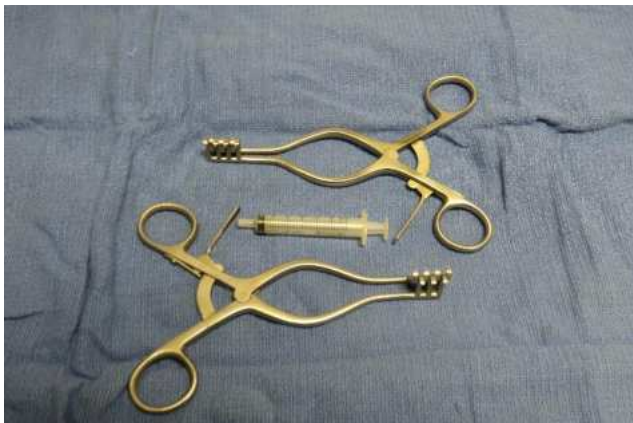
Baby weitlaner retractors, 2 pair (4 total)