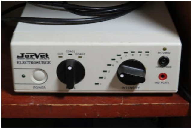
Jorvet Electrosurge with ground plate, hand pieces. Machine in excellent condition, ground plate and hand piece are well used.