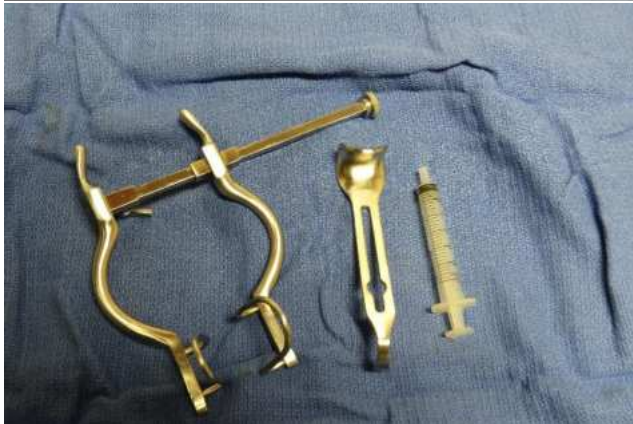
Baby Balfour (not gold – it's the lighting) good size for puppies and cats